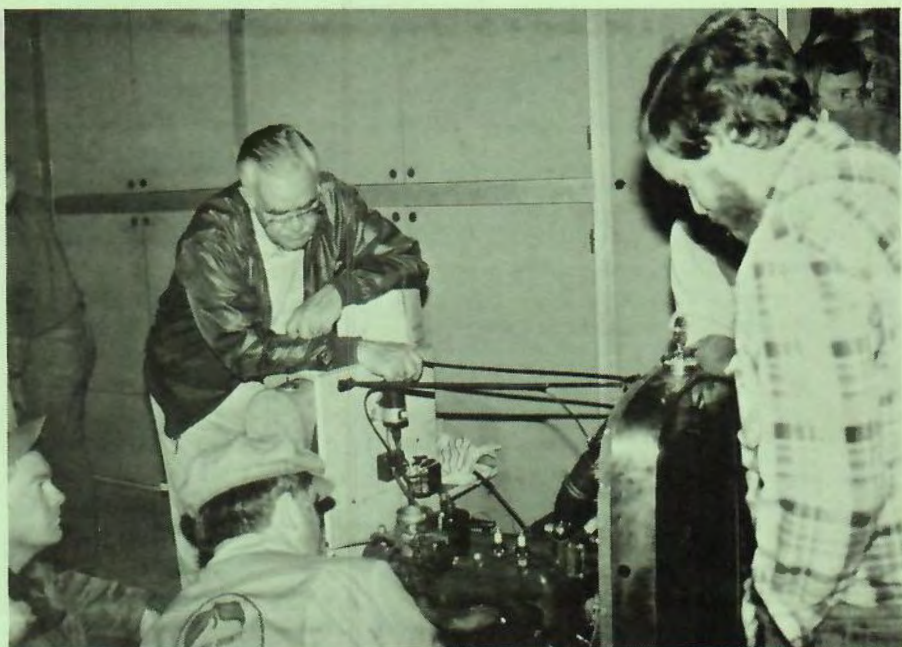
MORE MARCH SEMINAR