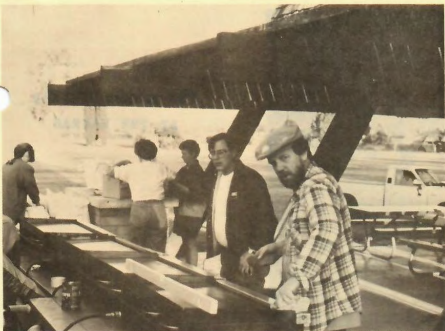
MORE GUYS--AND GALS.