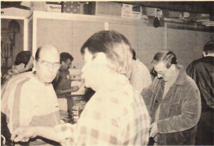
THE MARCH SEMINAR AT THE WAVRAS