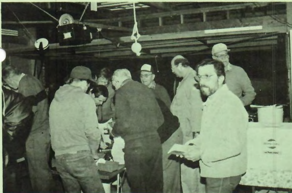
MORE MARCH SEMINAR THIS IS A FLOCK OF FELLOWS.