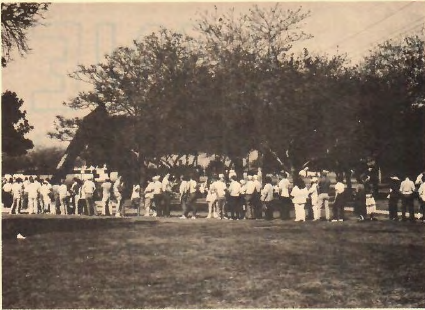
LOTS OF HUNGRY MOUTHS.