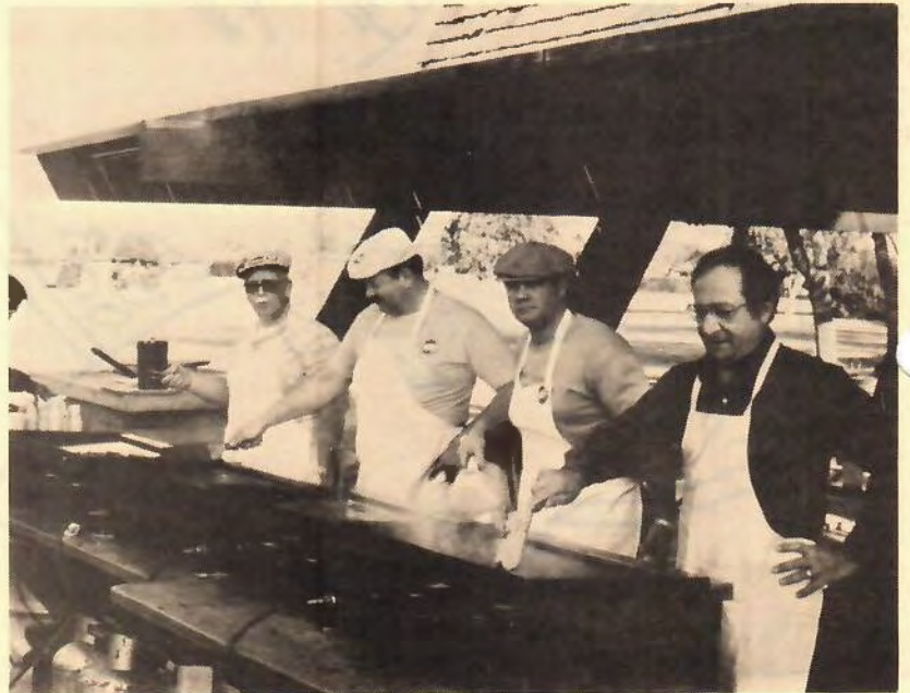
WOULD YOU TRUST THESE GUYS?